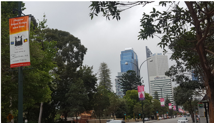
BreastScreen WA's new banners brightened up St George's Terrace from Barrack Street to Victoria Avenue during International Women's Day week.