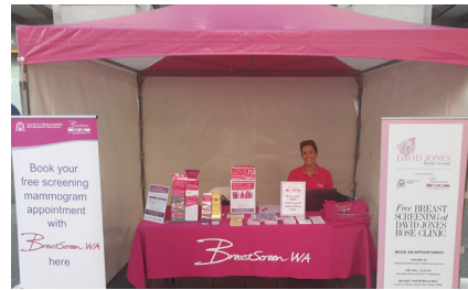
Our information stall in Murray Street Mall during International Women's Day week saw us book in 14 ladies. Most women admitted ignoring their reminders but felt our presence was a "sign" to book!